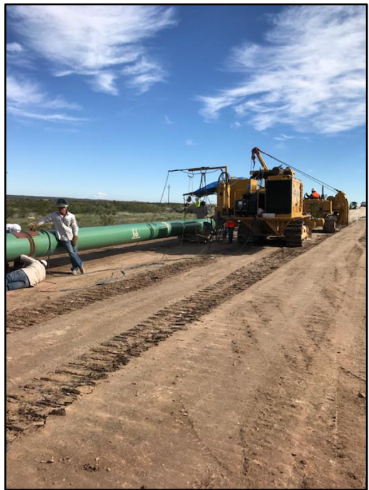
The fire line on the 24" project.