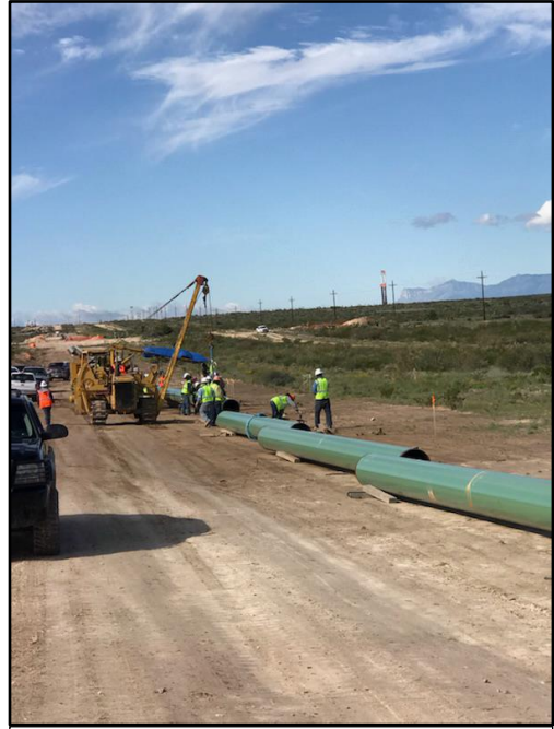
JJ Harpole's front end crew on the 24" job.