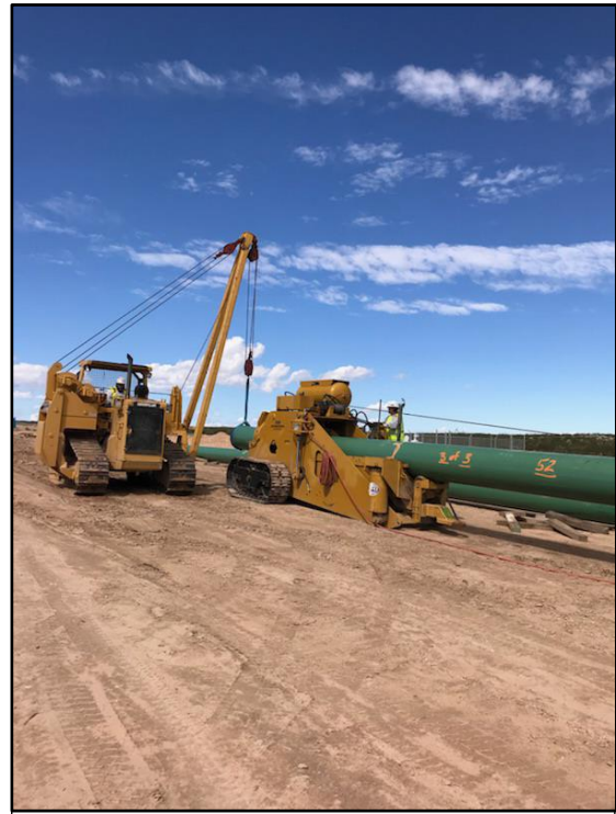
JJ's bending crew on the 24" project.