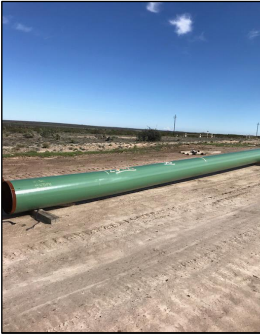
Pipe on the 24" project.