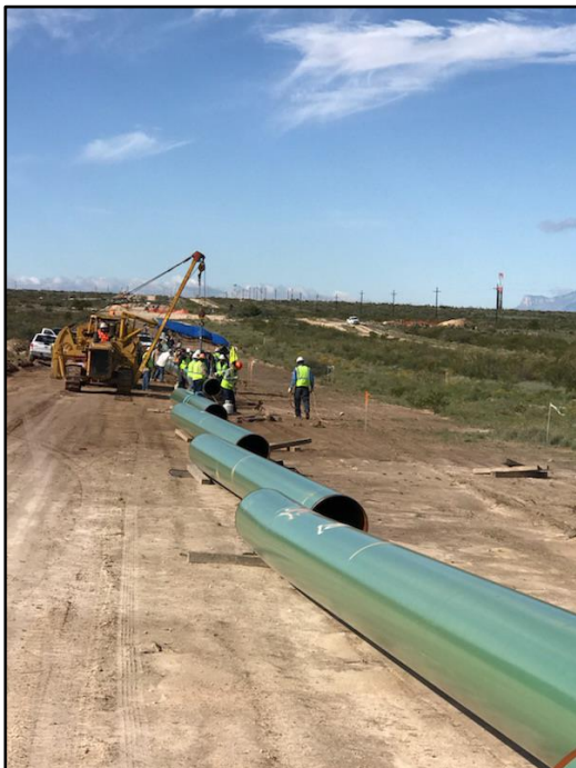
JJ Harpole's front end crew on the 24" job.