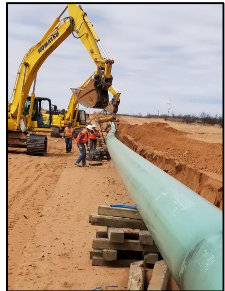
Lower in crew in West Texas.

Our Northern Rockies division picked a small facility project in Idaho. The project consists of a compressor station controls upgrade. We are planning to complete the work in five weeks. Changing out valves, actuators, painting.