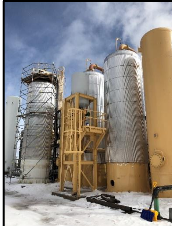
Scaffolding for Arizona Plant.