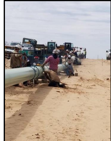
Firing line on the West Texas job.