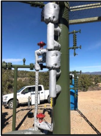
Insulation for FMOA project.

Although, our year got off to a slow start we are steadily working on completing the major pipeline project and other various small projects. We are just moving along in the year and hoping that everything continues to run smoothly.